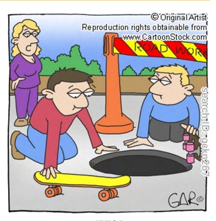
"Kids! Where's your brother?"